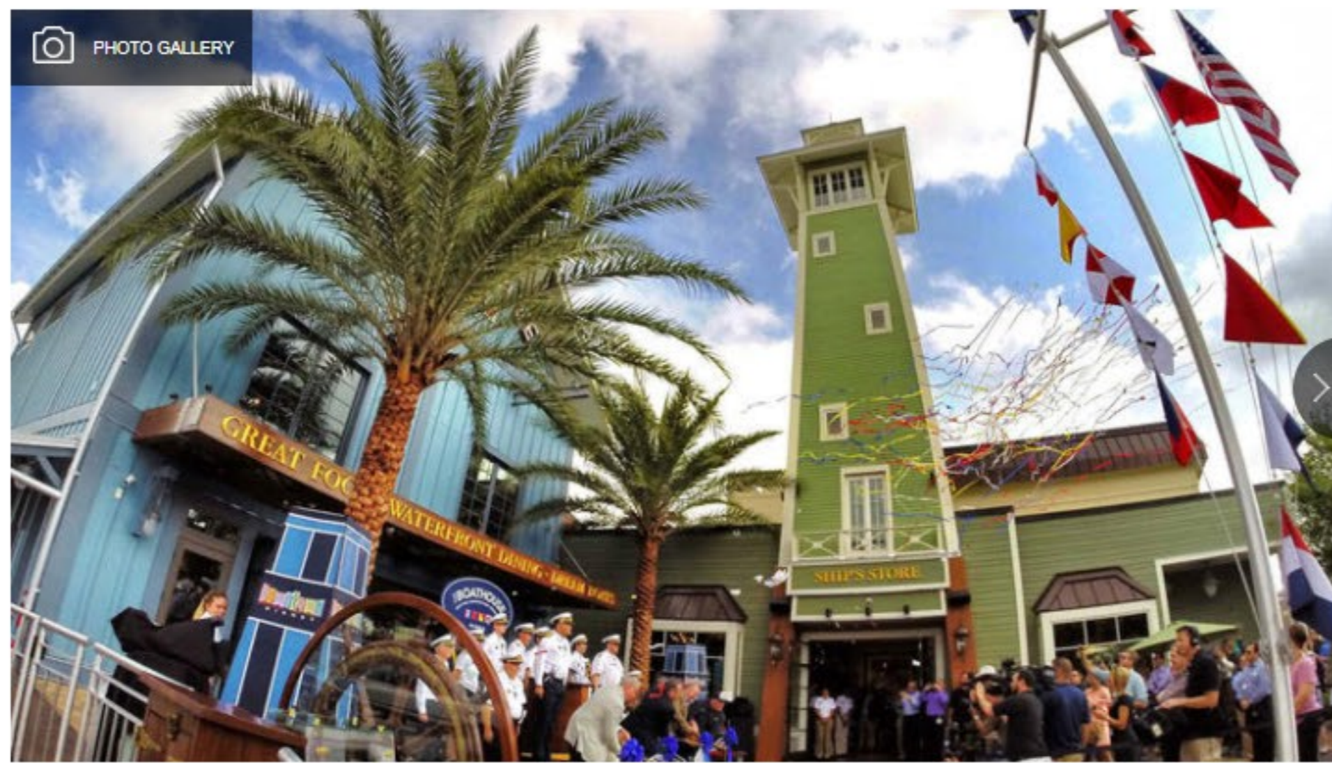
Photos of The Boathouse, one of several new restaurants at Downtown Disney as the area transitions into Disney Springs. The Boathouse offers a menu of steak, chops, fresh seafood and a raw bar, and the restaurant showcases "Amphicars" -- vehicles that drive from dry land into the water.