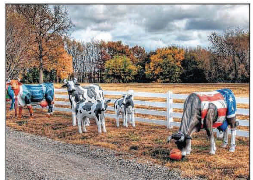
The 15 playful fiberglass cows are a big attraction.

"It's one of the coolest things I've done in my life, especially to share with Eden Prairie," he said. "The goal is to make people smile and to share with everyone, instead of private space for my laboratories. There's probably nothing