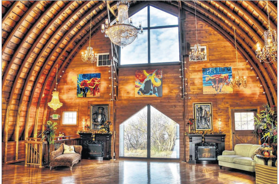
The main hall features chandeliers, fireplaces and original artwork. People are already making event reservations for 2013 and 2014.

It's a design touch that's certainly unique, but the creative CEO said this project is different and simpler than any of his